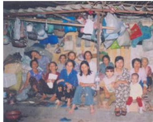
Women spend the night in a make-shift shelter

Official power abuse and corruption amongst Communist Party and government officials are a major source of land abuses against women. Reporting on the illegal confiscation of lands in the rural areas, Major-general Trinh Xuan Tu, Deputy Head of the General Department of Public Security told Vietnam's National Assembly in 2006 that more than a third of illegal land confiscations were committed by government and Party officials. He cited many cases, including that of Van Giang, Hung Yen province, where the local authorities reclaimed 522ha of land for a project. 3,940 families who were supported by the land were expropriated without any alternative employment or compensation. 86 State corruption and power abuse penalize women in particular, since women lack knowledge about their rights and access to legal support. Moreover, in Vietnam's one-Party state system, it is extremely difficult to oppose decisions of corrupt or abusive state officials.