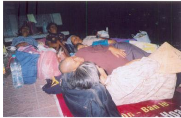
Victims of Injustice spend the night in Mai Xuan Thuong Park