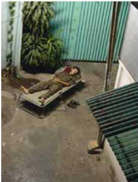
Security Police camp day and night outside UBCV pagodas