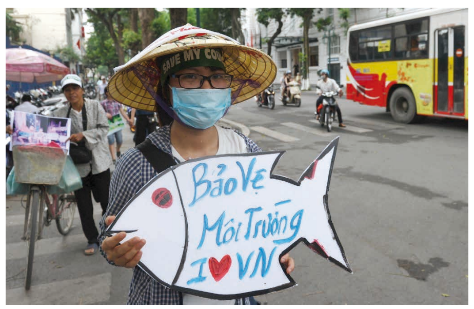
Protesters demonstrate against Taiwanese conglomerate FHS during a rally in Hanoi on 1 May 2016.

According to information received by VCHR, on 8 May, in the protests in Hanoi and Ho Chi Minh City, police looked on passively as government-hired thugs brutally beat peaceful demonstrators. Dozens were arrested and held in "social protection centers" for several days before being released.