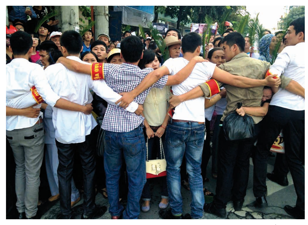
Plainclothes policemen form a human chain to prevent hundreds of protesters from approaching the court where lawyer Lê Quốc Quân faced charges of tax evasion at his trial held amid heavy security in Hanoi on 2 October 2013.