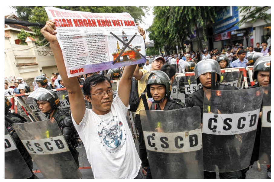
An anti-China protester stands in front of policemen blocking a street leading to the Chinese consulate during a rally in downtown Ho Chi Minh City on 11 May 2014.

The signing of two controversial border treaties between Vietnam and China in 1999 and 2000 without any public consultation triggered deep public outrage among Vietnamese from all walks of life, both inside and outside the country, and was followed by a torrent of spoken and written protests. <sup>109</sup> To the Vietnamese government's surprise, the signing of these agreements also ignited a flame of passionate patriotism within the population that continues to burn bright today. <sup>110</sup>