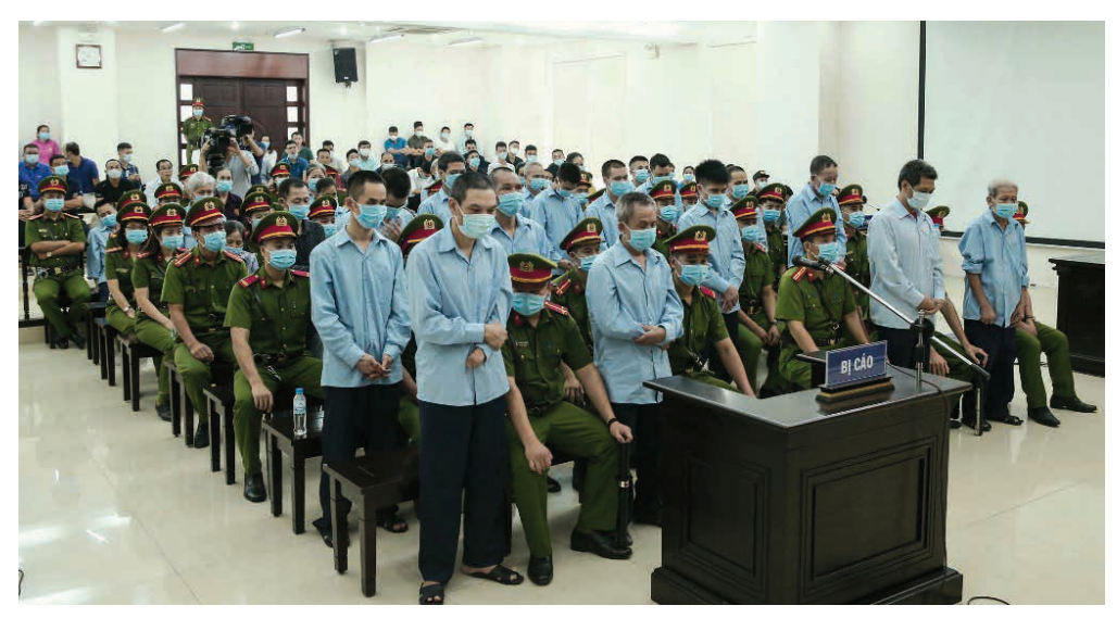
This picture taken and released by the Vietnam News Agency on 14 September 2020 shows Dong Tam villagers involved in a land dispute attending their court trial in Hanoi.

Lawyers have not only been denied access to their clients during the investigation period, but have also frequently not been provided with case files until a few days before the trial. During hearings, courts have often refused to hear testimony from witnesses requested by defense lawyers, as was the case in the trial of the Dong Tam villagers in September 2020, which resulted in two death sentences and extremely long prison sentences [See above, Chapter 4.3.4. ].