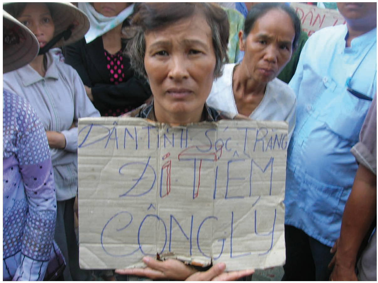
A woman demonstrates outside the National Assembly Office No. 2 in Ho Chi Minh City in July 2007. Her banner reads: "The peasants of Soc Trang Province call for justice."

Between 2000 and 2015, hundreds of thousands of expropriated peasants and farmers, including many women, repeatedly marched from the countryside to Hanoi or Ho Chi Minh City to demonstrate outside government buildings and file complaints on abuses of land rights.