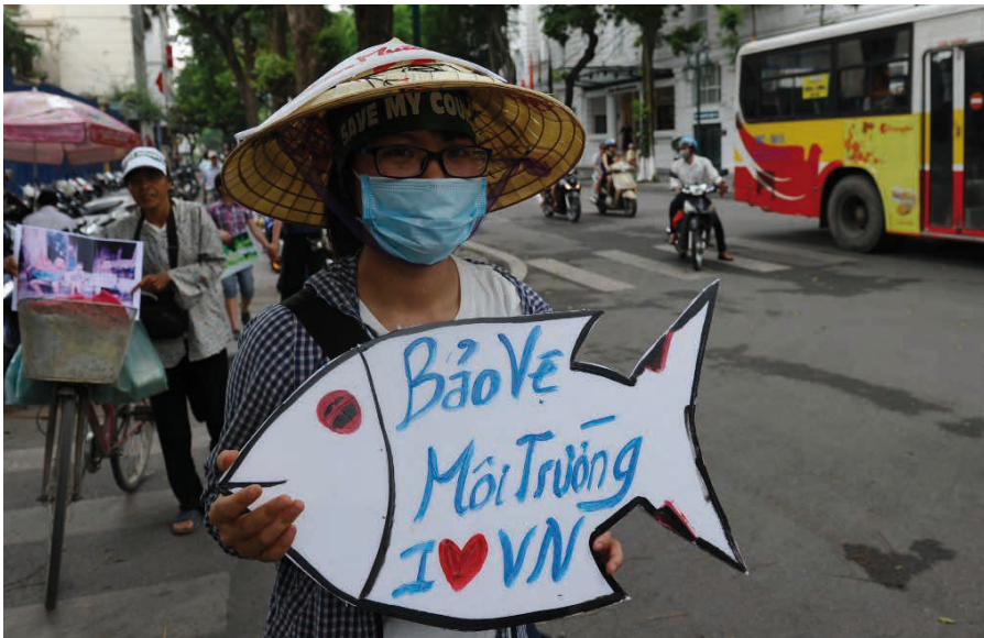
Protesters demonstrate against Taiwanese conglomerate FHS during a rally in Hanoi on 1 May 2016.

According to information received by VCHR, on 8 May, in the protests in Hanoi and Ho Chi Minh City, police looked on passively as government-hired thugs brutally beat peaceful demonstrators. Dozens were arrested and held in “social protection centers” for several days before being released.