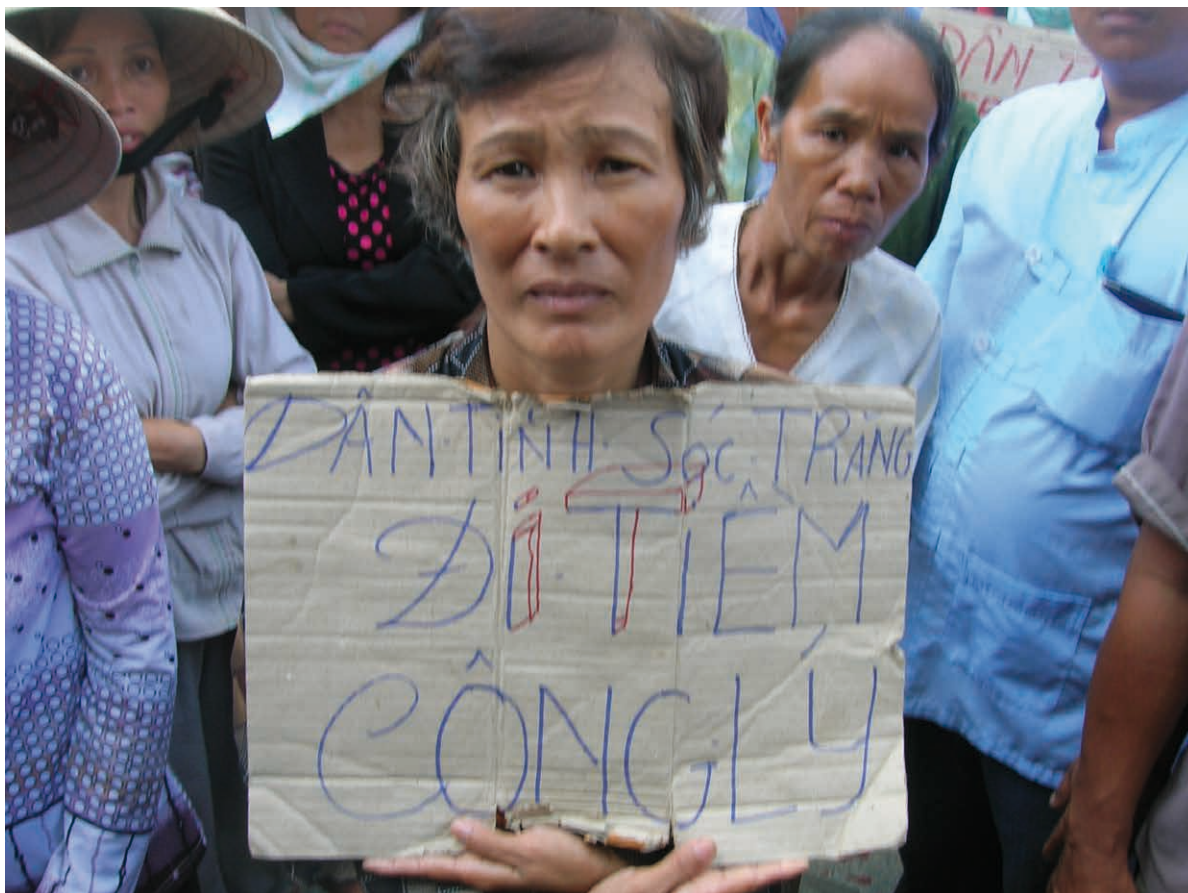
A woman demonstrates outside the National Assembly Office No. 2 in Ho Chi Minh City in July 2007. Her banner reads: “The peasants of Soc Trang Province call for justice.”

Between 2000 and 2015, hundreds of thousands of expropriated peasants and farmers, including many women, repeatedly marched from the countryside to Hanoi or Ho Chi Minh City to demonstrate outside government buildings and file complaints on abuses of land rights.