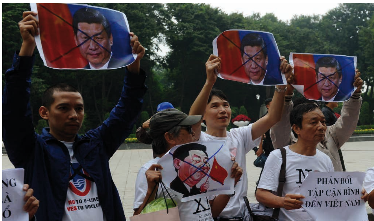
Protesters shout anti-China slogans as they hold up marked depictions of China's President Xi Jinping in front of the Chinese embassy in Hanoi on 5 November 2015, a few hours prior to the arrival of the Chinese leader for a two-day state visit.

Xi Jinping's visit to Vietnam in 2015. He was finally arrested on 1 March 2022, and sentenced to eight years in prison on 12 May 2023 under Article 117 of the Criminal Code. 177