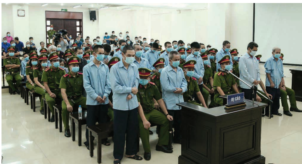
This picture taken and released by the Vietnam News Agency on 14 September 2020 shows Dong Tam villagers involved in a land dispute attending their court trial in Hanoi.

Lawyers have not only been denied access to their clients during the investigation period, but have also frequently not been provided with case files until a few days before the trial. During hearings, courts have often refused to hear testimony from witnesses requested by defense lawyers, as was the case in the trial of the Dong Tam villagers in September 2020, 163 which resulted in two death sentences and extremely long prison sentences [See above, Chapter 4.3.4. ].