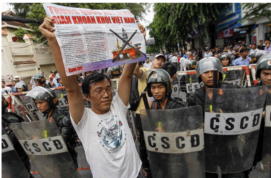
An anti-China protester stands in front of policemen blocking a street leading to the Chinese consulate during a rally in downtown Ho Chi Minh City on 11 May 2014.

The signing of two controversial border treaties between Vietnam and China in 1999 and 2000 without any public consultation triggered deep public outrage among Vietnamese from all walks of life, both inside and outside the country, and was followed by a torrent of spoken and written protests. 109 To the Vietnamese government's surprise, the signing of these agreements also ignited a flame of passionate patriotism within the population that continues to burn bright today. 110