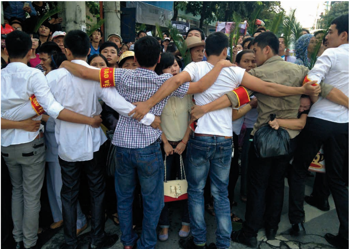
Plainclothes policemen form a human chain to prevent hundreds of protesters from approaching the court where lawyer Lê Quốc Quân faced charges of tax evasion at his trial held amid heavy security in Hanoi on 2 October 2013.