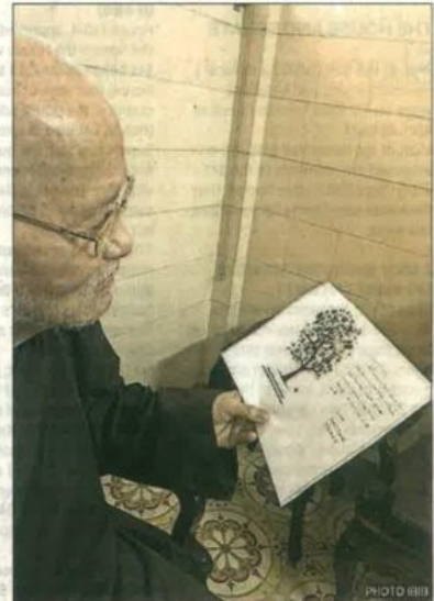
Thich Quang Do, patriarch of the Unified Buddhist Church of Vietnam, receives letters of praise.